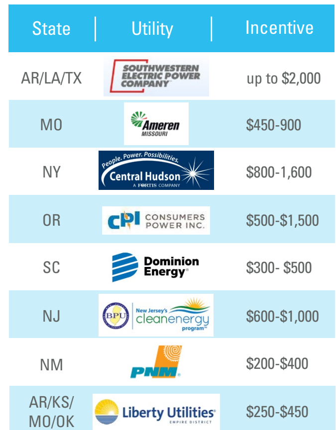
Table 1: Examples of ENERGY STAR Certified Air Source Heat Pump Incentives

Many utilities offer incentives for installing ENERGY STAR certified ASHPs. Table 1 below shows several examples from across the country. Check with your local utility for more details or go to: www.energystar.gov/rebatefinder .